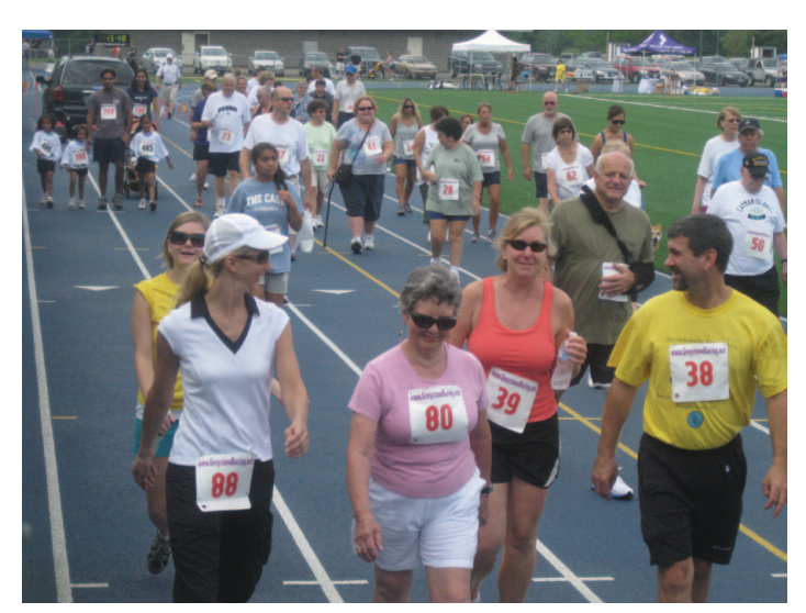
▲ The 1-mile walk begins.